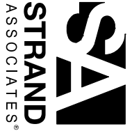
FIGURE NO. JOB #

TOWN OF BROOKFIELD WAUKESHA COUNTY, WISCONSIN